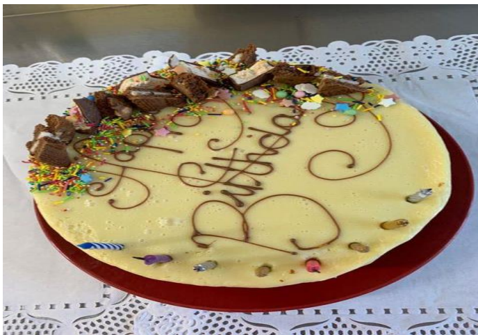
100 th Birthday Celebrations!