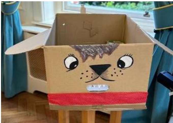
Collection for Waggy Tails Dorset!