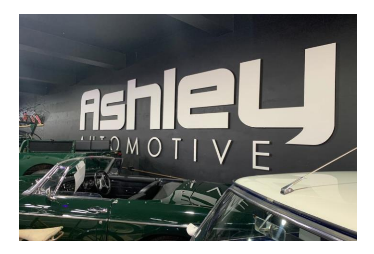
Trip Out to Lockett Fuel!