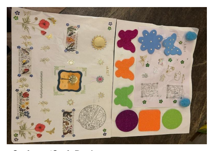
Crafts at 'Craft Box' event