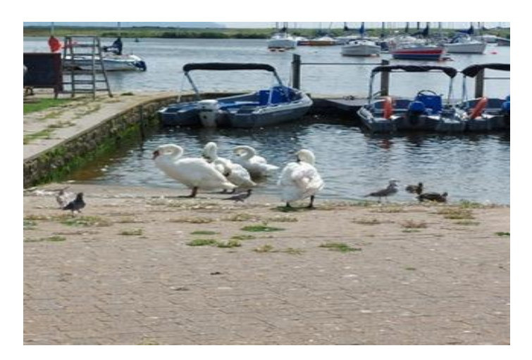
Trip Out to Christchurch Quay!