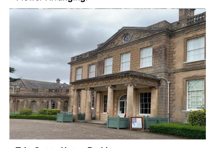
Trip Out to Upton Park!