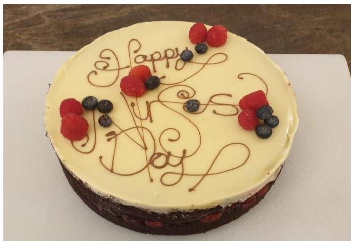
Happy Nurses Day 12 th of May 2023!