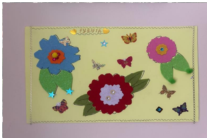
Residents card making!