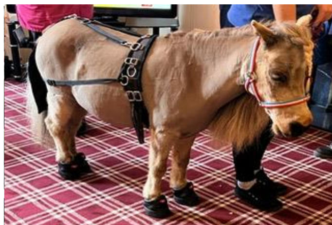
Visit from Mr. Kellogg's!