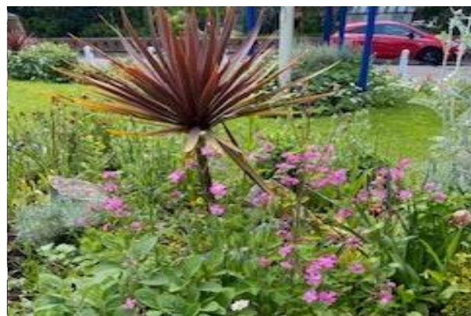
Drumconners beautiful garden!