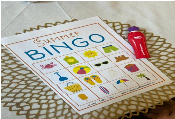
Kathleen's Picture Bingo!