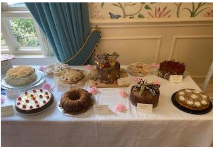
Bake Off entrants!