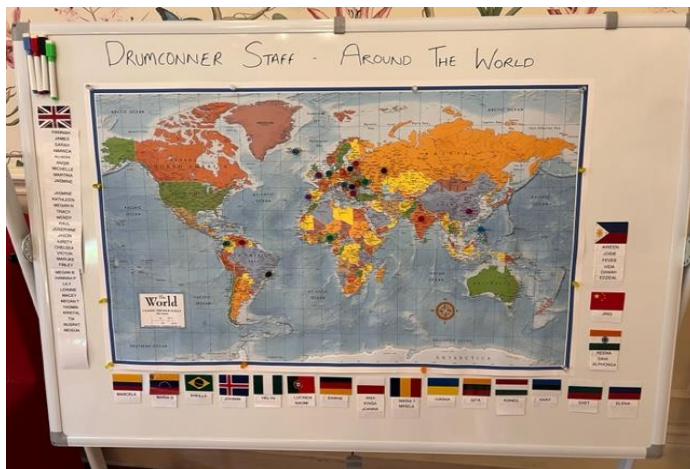
Drumconner Staff – Around the World!