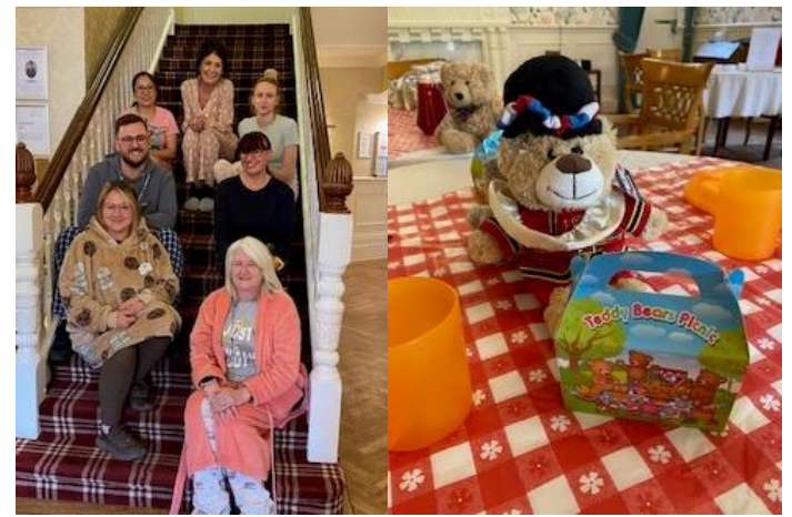
Pyjama Day and Teddy Bears Picnic!