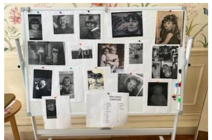
Staff Pictures from their Childhood!